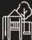
PLAYGROUND AND GREENRY