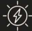
UNINTERRUPTED POWER SUPPLY